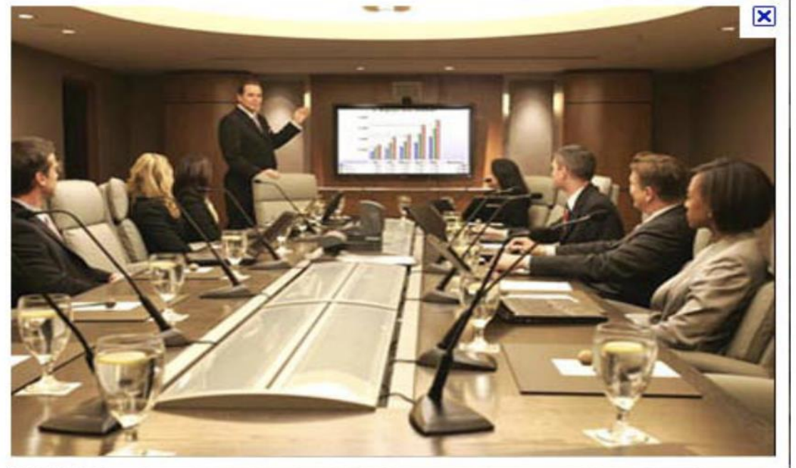
Lean Backward Meeting