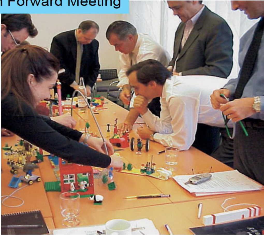
Lean Forward Meeting