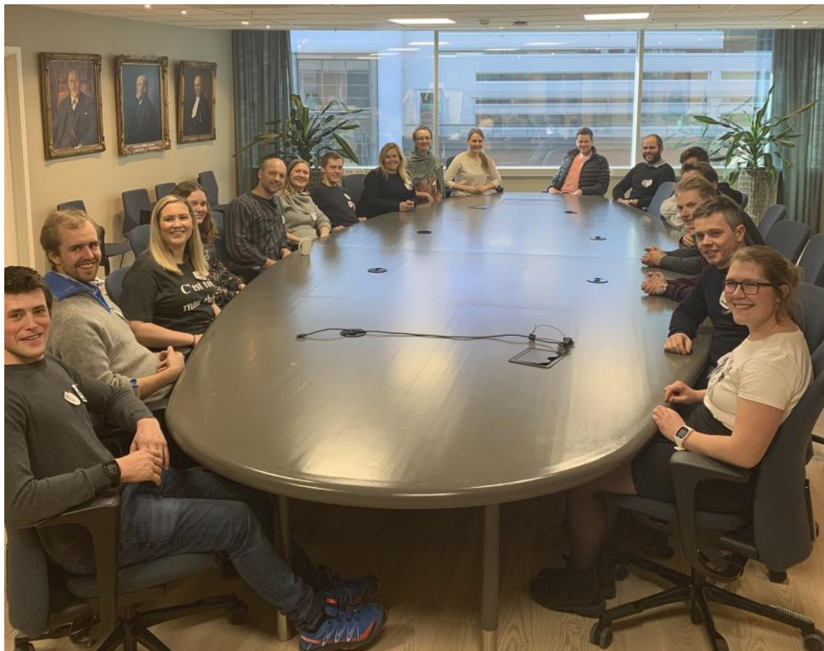
Picture from the Board Room of the Norwegian Farmers' Union

Watch out for these cooperative farmers in the future!