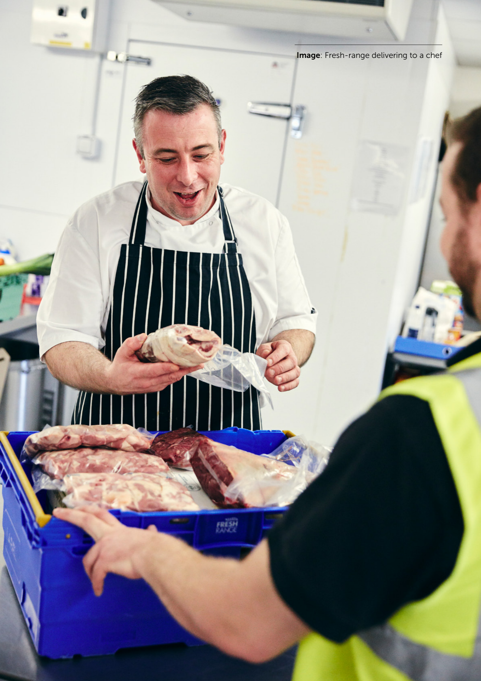
Image: Fresh-range delivering to a chef