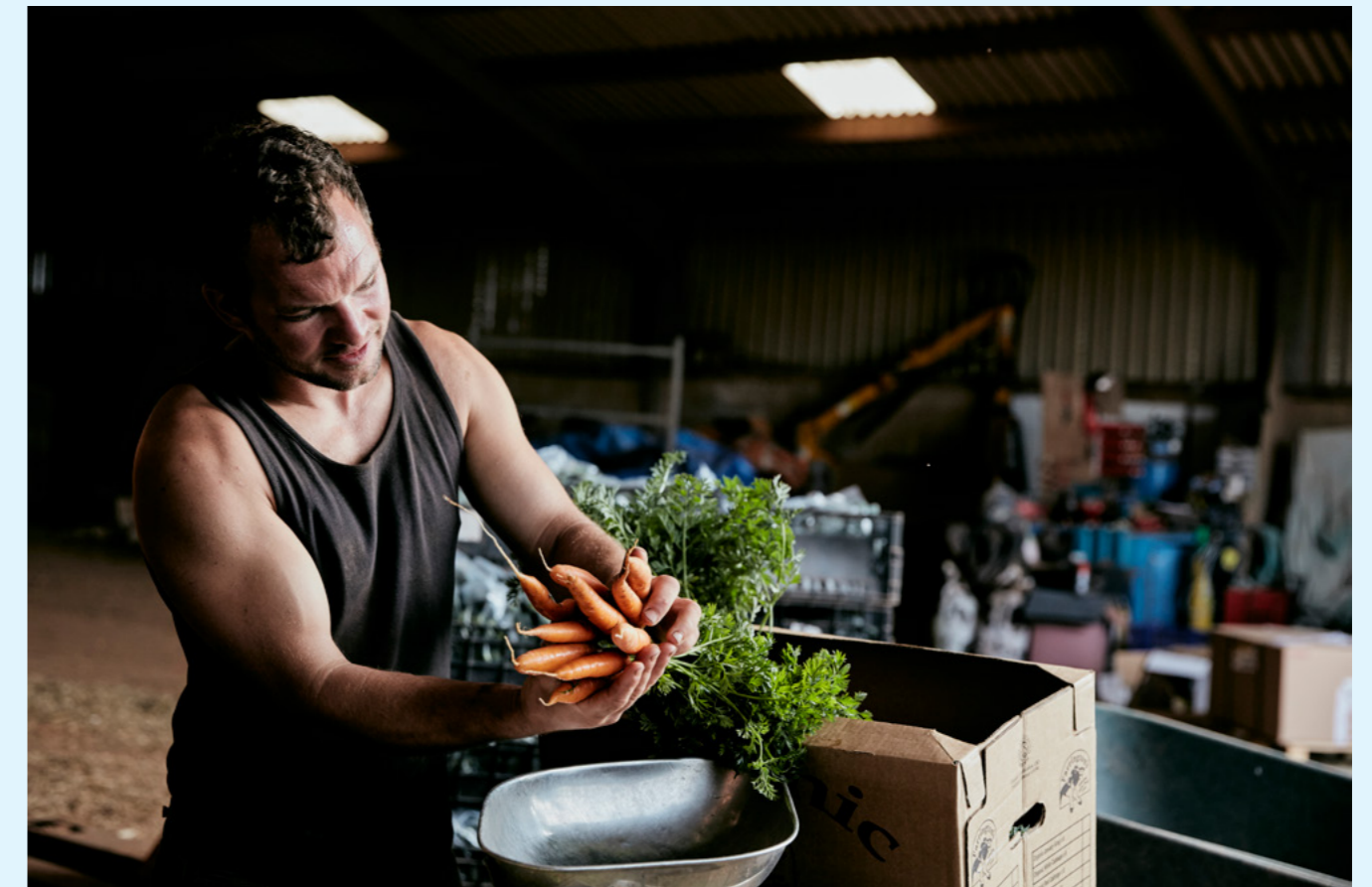
Image: Packing boxes at Farringtons