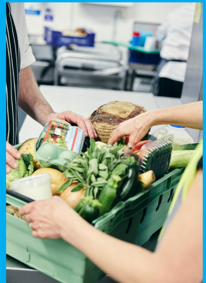
Images: Producers picking at Farringtons (top and middle), and Fresh-range delivering their catering boxes (bottom)