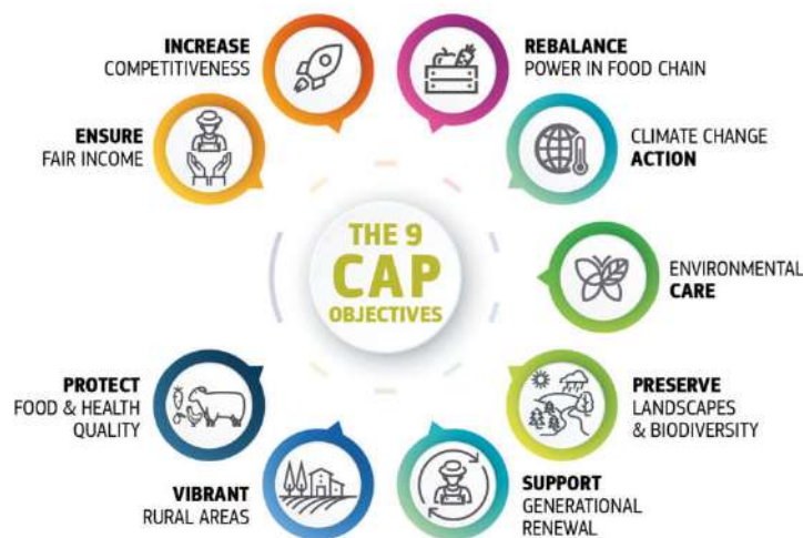
The 9 CAP Objectives of the European Commission

On 1 June 2018, the European Commission presented the legislative proposals on the future of the CAP from 2020 onwards. Based on nine objectives, the future CAP will continue to ensure access to high-quality food and strong support for the unique European farming model.