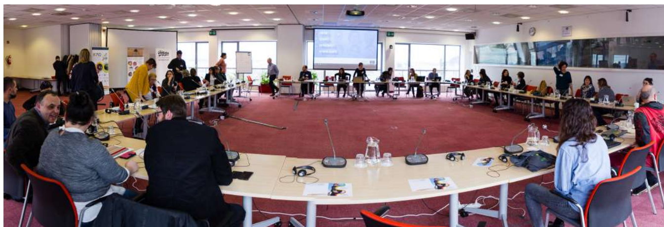
Policy Round Table on Green Public Catering organised by Védegyelet, Hungary