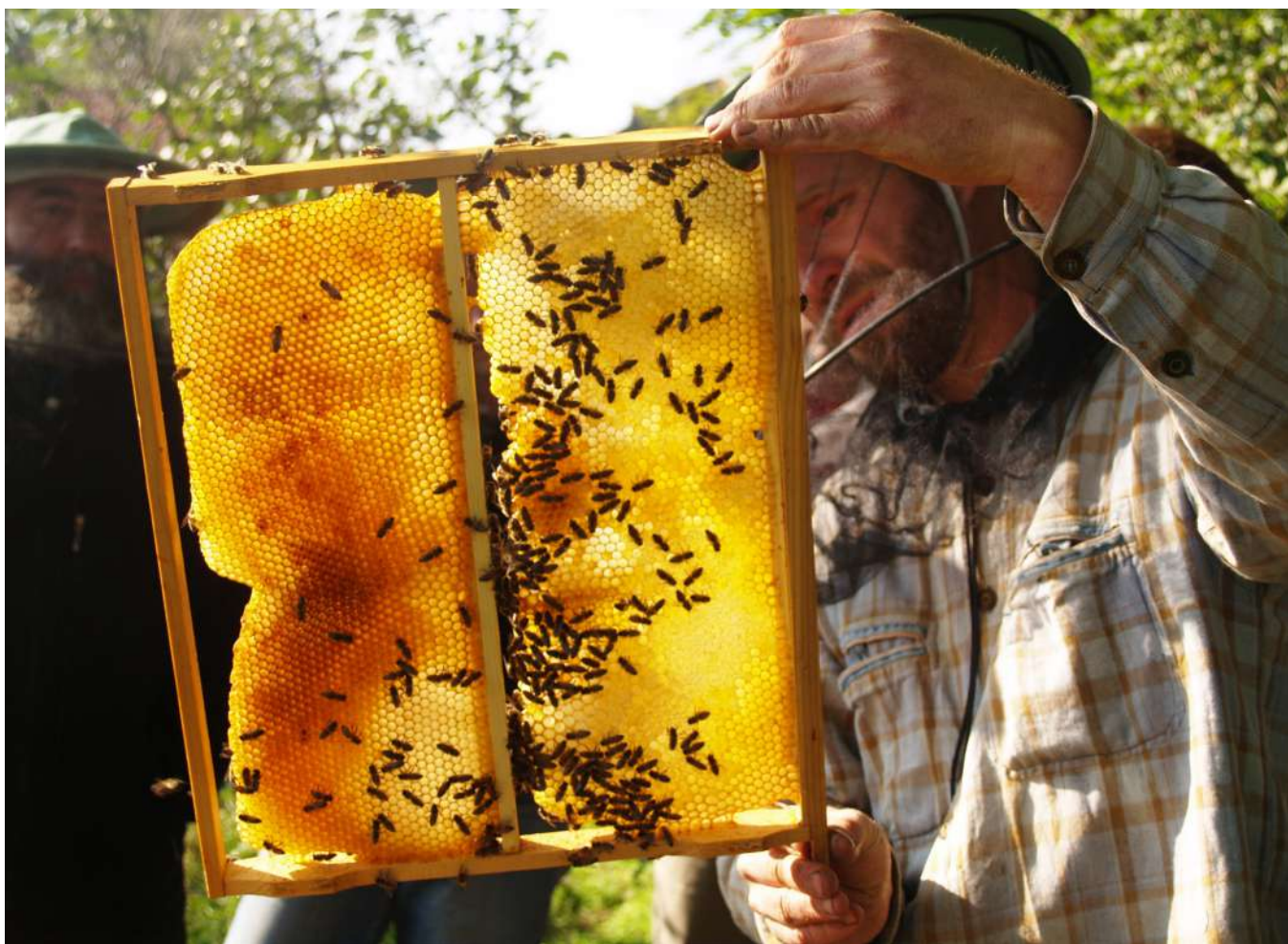
Átalakuló Közösségek (Transition Network).

The term 'social capital' refers to people's ability to work together in groups. Francis Fukuyama defines the concept more broadly and includes "any instance in which people cooperate for common ends on the basis of shared norms and values". 24 Social capital is an asset and allows individuals to group together, defend their interests and organize to support their collective needs; therefore, it is a crucial ingredient