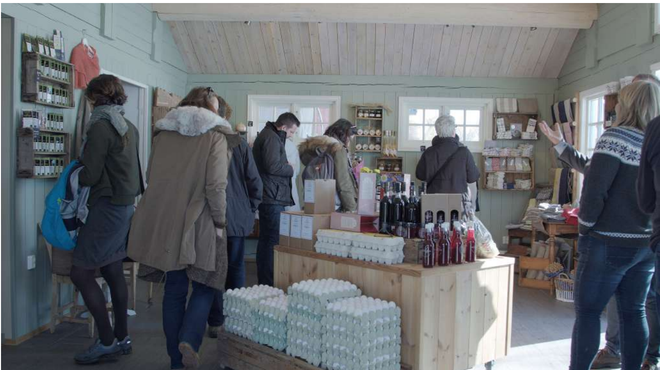
Norwegian Study tour, BOND Project

BOND organized 6 study tours and visits to key selected sites in 6 countries (Netherlands, Norway, France, Italy, Spain, and the UK), for face to face encounters and common sharing and exploration of practices between those who have successfully reached higher levels of aggregation and governance, having acquired a stronger position in negotiation and policy design, and those who are in the process of engaging in more collective practices. These could be individuals, groups, cooperatives and other entities in countries where the level of organization is considered low. These immersions and interactions benefited a total of 60 representatives of farmers and land managers groups and entities, including group leaders, facilitators, intermediaries. These were then able to bring back home to their own countries, the knowledge and experiences acquired during the trips. The study tours also contributed to developing closer ties between the different stakeholders and the creation of interregional networks, using social media platforms. Altogether 5 representatives from Croatia and 5 from Hungary participated in 5 different study tours.